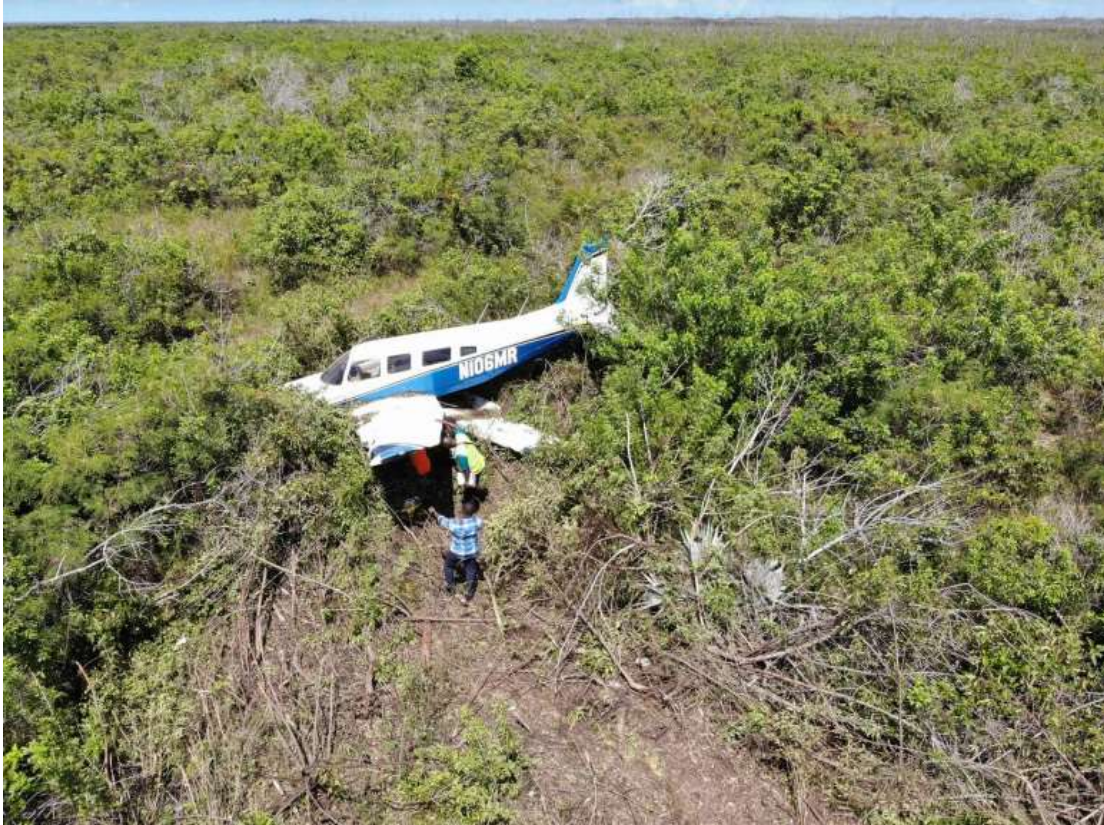
Fig. 2 Drone photo of N106MR