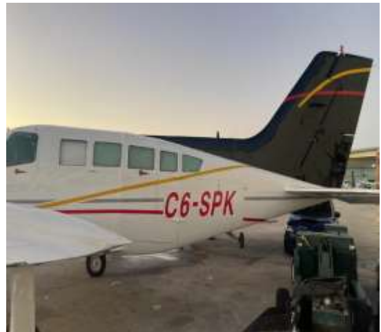
Fig. 3: Photos of aircraft