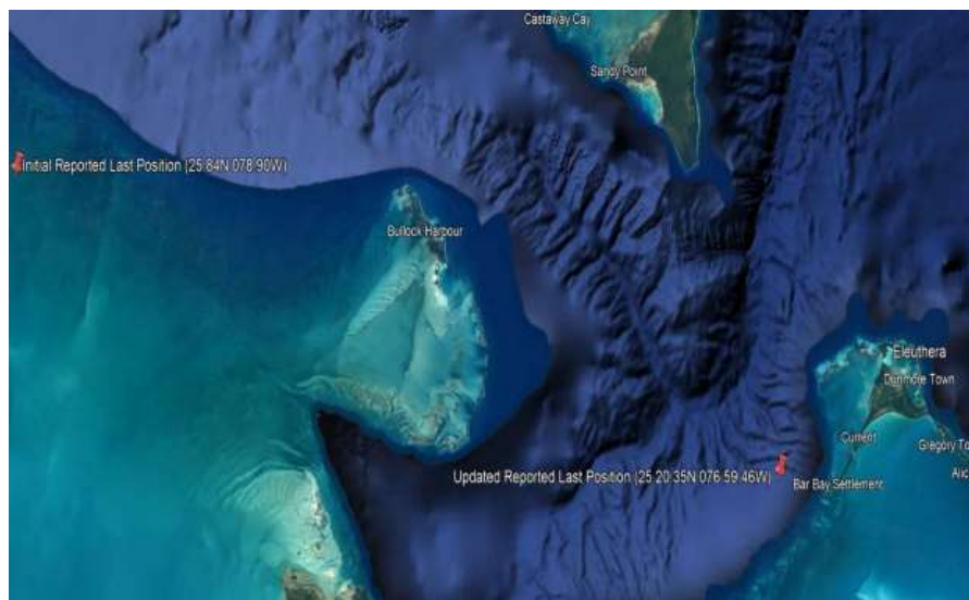
Fig. 1: Last known position of aircraft 17NM southwest of North Eleuthera Airport, Bahamas