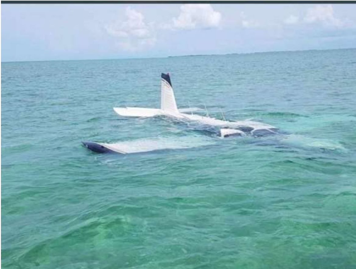
Fig.3 N3790W submerged off North Andros, Bahamas